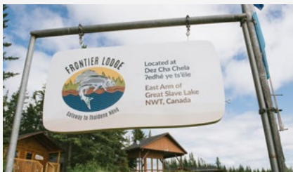
PAT KANE / NWTT