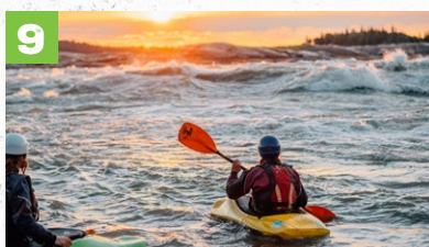
DARREN ROBERTS / NWTT

Follow a short trail, west of Fort Smith in Wood Buffalo National Park, to the shimmering Salt Plains. Remove your hiking boots and stroll barefoot over this crystalline landscape, where saline minerals leach from an ancient seabed.