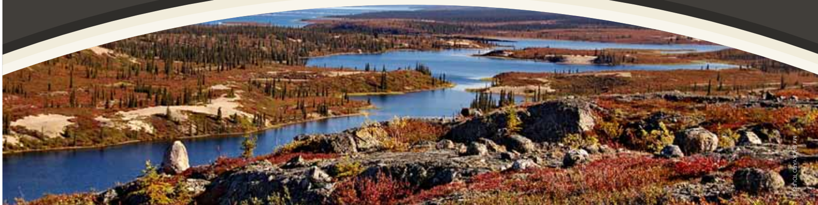
SPHOL CRAVAK / AMY