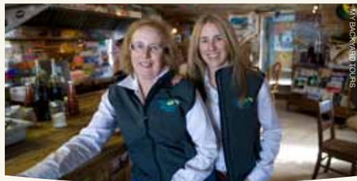
MY BACKYARD TOURS