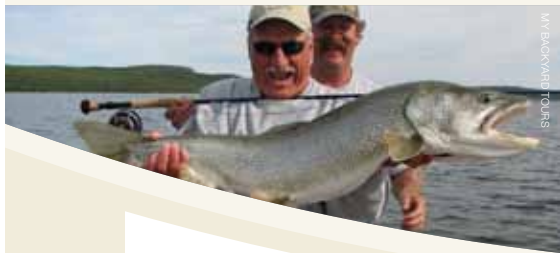
MY BACKYARD TOURS