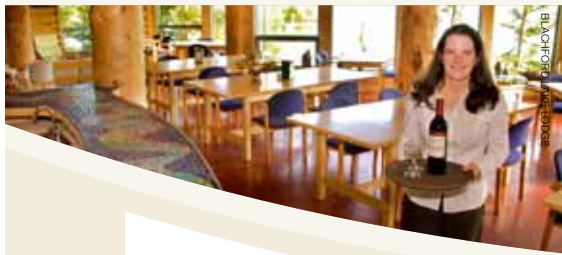
BLACHFORD LAKE LODGE