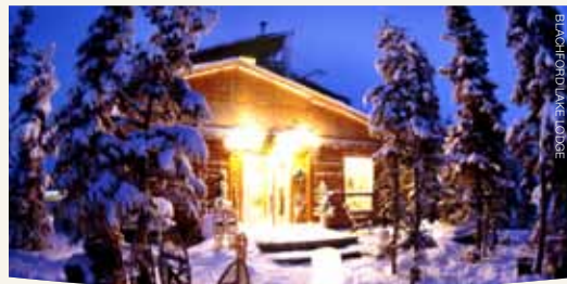
BLACHFORD LAKE LODGE